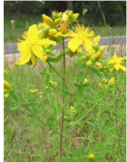
St Johns Wort